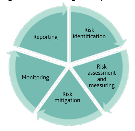
Figure 3. Risk management process

The overall risk management process includes five main steps: risk identification; risk assessment and measuring; risk mitigation; risk monitoring and risk reporting. Additionally, forward looking own risk and solvency assessment (ORSA) is conducted at least annually and is implemented as a part of the Risk Management System. In ORSA the three-year business plan and corresponding risk profile and capitalisation are analysed under different scenarios and stress tests with the aim to secure continuous solvency of the Company and to ensure the operations correspond to the risk appetite adopted by the Supervisory Board.