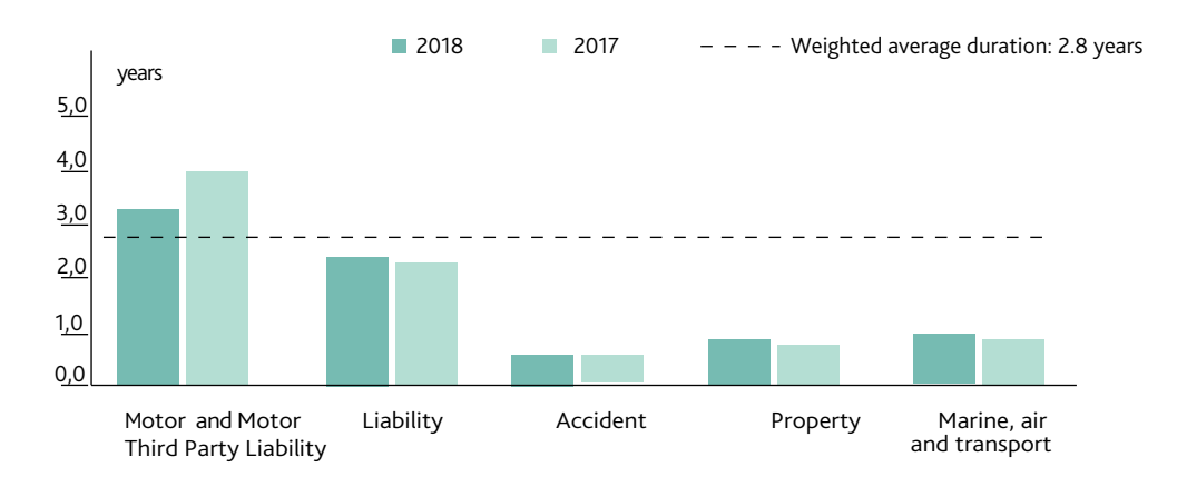
Figure 5. Duration of technical provisions by lines of business as at 31 December

The durations of technical provisions for various lines of business are shown in Figure 5. The structure and duration of technical provisions are also sources of interest rate risk and inflation risk, which are described in greater detail under market risk.