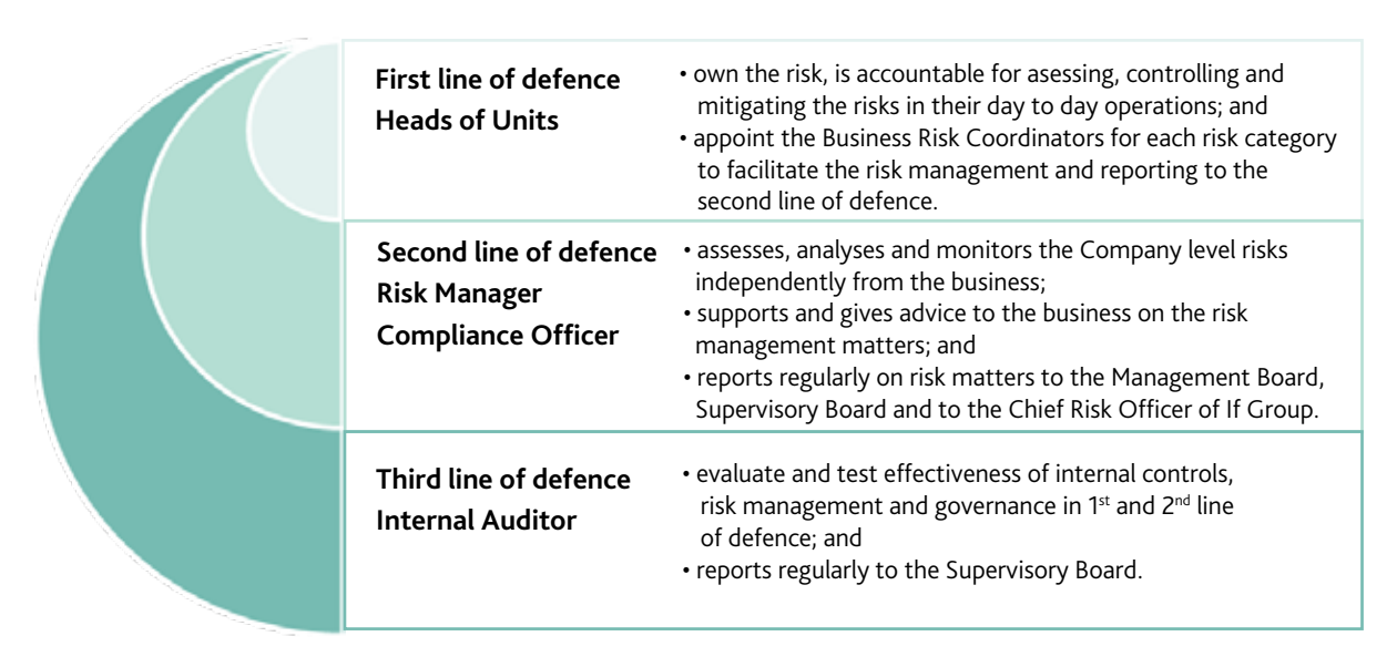
Figure 1. Three lines of defence concept

The main risk categories managed within the Risk Management System are: underwriting, market, credit, operational and other risks (Figure 2).